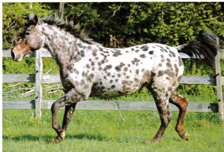
Sabrina—rescued in 2003 and placed in a loving home is back in our care as her adoptive mother's horse.

This 10th anniversary issue of The Horse's Voice features a timeline of just a few highlights of the past decade and the positive, lasting impact the support of our loyal donors has had on horses and humans.