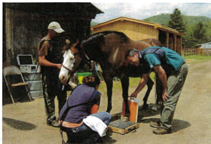
Rebel being x-rayed by our veterinarians to assess progress in the healing of a coffin bone fracture.

On the topic of bringing joy to those with developmental challenges, our program with Mountain Lake Services provides confidence-building opportunities with horses. Moreover, we learned this