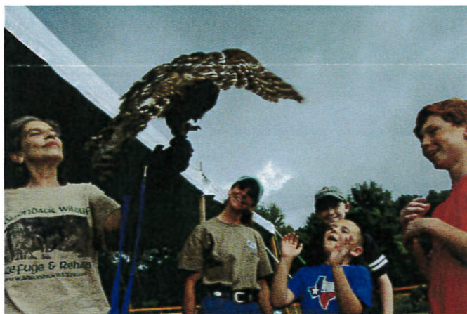
Visitors enjoy birds of prey at our open house.

On July 20 and 21, we held our 10th anniversary open house. We were thrilled to have a wonderful group of volunteers and adoptive parents help with the celebration, many of whom drove hours to spend the day with us. It was like a mini reunion.