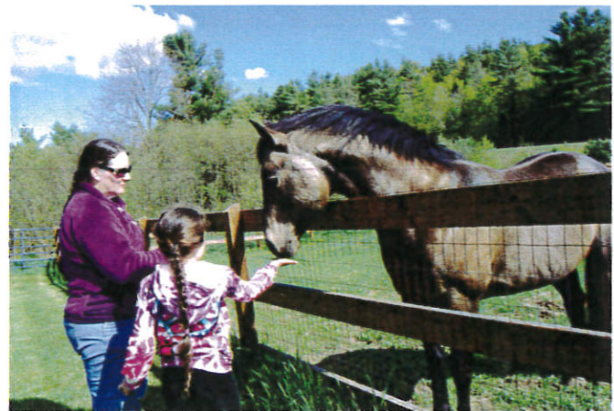
Mother-daughter field trip for Mother's Day.

On September 18 and 20, we participated in the largest horse seizure in Essex County history involving 41 horses. Since then, we've been coordinating the care for the horses, assisting with legal aspects of the case, and overseeing the adoption process. Our lives