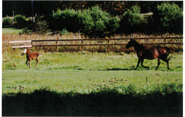
Mommy and George were the two most fragile horses from the seizure. This is just 3 weeks later at CMVHR.

number of horses. Led by the Essex County Sheriff's Department as impounding agent, Crane Mountain Valley Horse Rescue, two licensed veterinarians, NYS Humane Association, and a team of friends and volunteers removed 41 horses over a two day period from one property. Because our farm cannot accommodate that many horses at one time, we brought only the most fragile cases here. Three horses went to another private farm and all the others were taken to the Essex County Fairgrounds. As the local accredited equine rescue organization, in addition to our own crew, the horses at the Fairgrounds were also suddenly in our care, bringing our total charge to 48 horses. When word got out about the situation, the community jumped in....volunteers selflessly offered to clean stalls and feed; people donated hay, shavings, wheelbarrows, hoses, and buckets; the local 4-H and others lent round pens for turnout; two local farms took horses in foster care to lighten the load; and our friend, retired veterinarian-