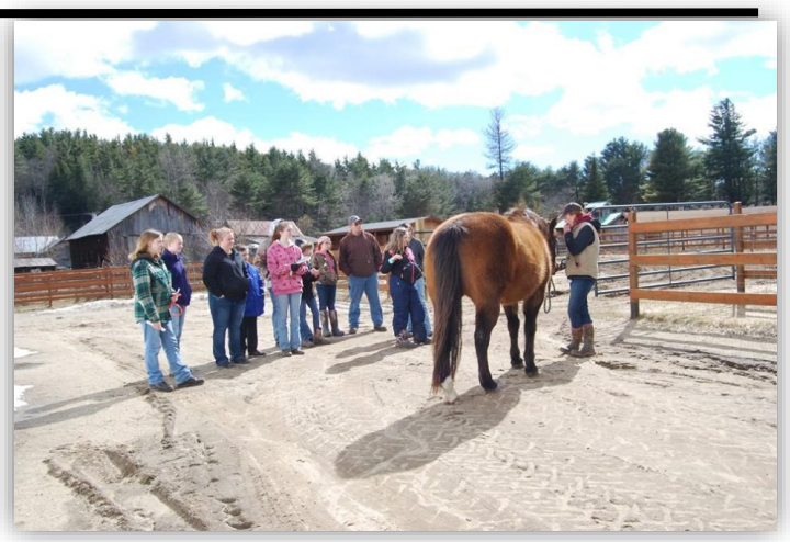
Equi-Riders 4-H Club learns how to check respiration and digital pulse and listen to belly sounds on Rebel.

In addition to internships, our work with at-risk youth has ongoing impact. This winter an 18 year old young man completed 100 hours of community service as a condition of probation. He endured the weather. enjoyed the challenge and discovered the magical healing power of the horse. Sometimes it's just about giving someone an opportunity they don't otherwise have. For this young man, his dream was to join the Army; a dream that is now